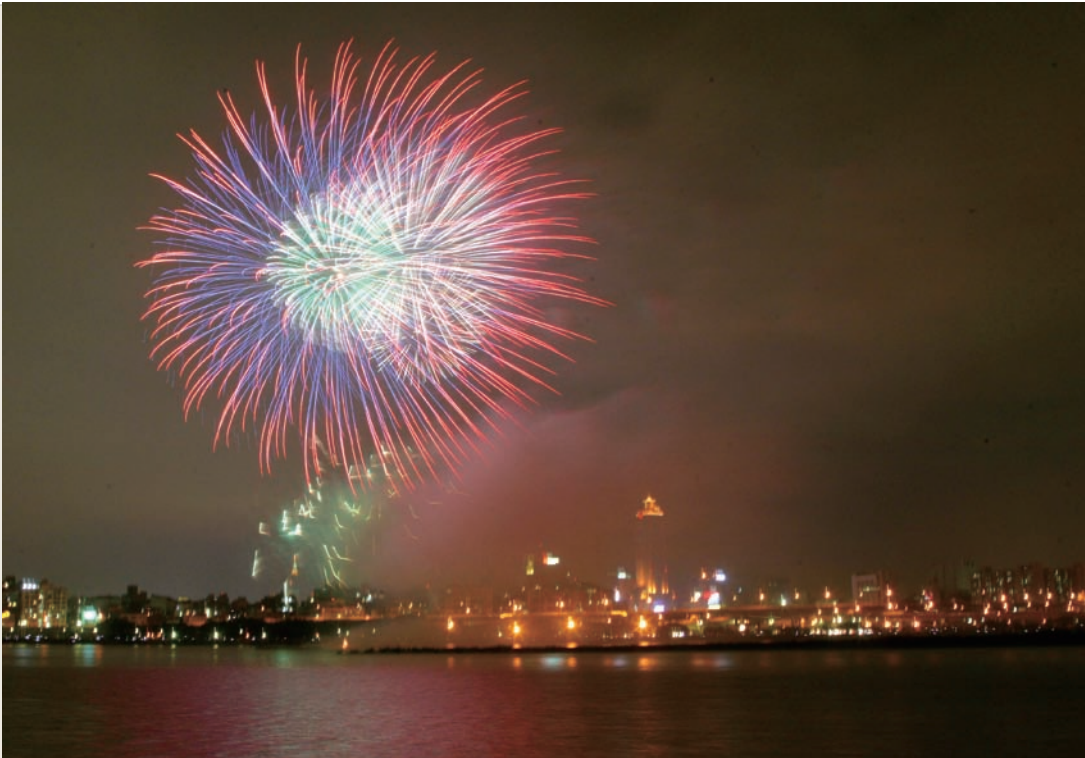
The theme of the fireworks show was “True Love in Dadaocheng, Spectacular Taipei”

The fireworks showered down in gold and purple hues over the 800-meter-long Zhongxiao Bridge, ending the National Day activities in Taipei on a romantic note. This was followed by peony fireworks, fireworks spelling out the Chinese characters for “I Love Taipei,” and heart-shaped fireworks. These and other dazzling pyrotechnic displays were reflected on the Danshui River, setting a joyous tone to the night and bringing the mood to a climax. Over 20,000 fireworks were used for the 30-minute display, which attracted 500,000 spectators thanks to broad media coverage.