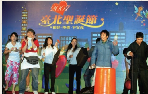
The Taipei City Government organized a series of Christmas activities to share good cheer with city residents

As part of the Christmas event, church choirs, ethnic groups, and international friends presented choral performances at 2:00 p.m. each weekend between December 8 and 23, 2007. Performed at the