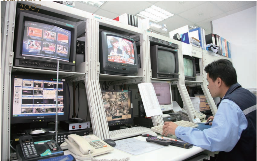
Cable TV providers monitor television broadcasts

In one of the highlight events in the cable TV industry for 2007, the Department of Information and Tourism of the Taipei City Government convened the 4th meeting of the Cable Television Viewing Fee Commission and decided to reduce the monthly upper fee for basic cable TV service in Taipei City from NT$550 to NT$530 per subscriber. Among other matters addressed during the meeting, service providers were required to reduce the fees for low-income households registered with the Department of Social Welfare of the Taipei City Government, from one-half of the normal fee, as originally approved by the Taipei City Government, to one-third the normal fee.