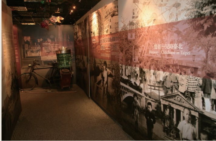
The special exhibition "The Childhood Years in Taipei"

In addition, the Discovery Center of Taipei organized a promotional exhibit at the "2007 Taipei International Travel Fair" from December 14 to 17, attracting over 500,000 visitors. It also held press conferences to promote its major exhibitions during the year, such as "The Childhood Years in Taipei," "40th Anniversary of Taipei's Upgrading to a Special Municipality," and "Hundred Years