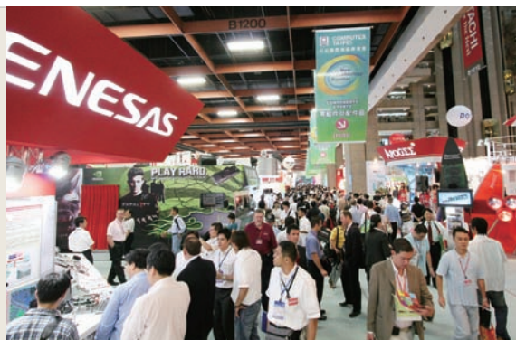
Fairgoers visit exhibit booths at Computex Taipei

Digital home and wireless communication technology were the two focal points of "Computex Taipei 2007". Exhibitors presented a host of new and exciting application products enabled by maturing technology and falling component prices, such as overclocked notebook PCs, digital photo frames, and a variety of ingeniously designed cell phones.