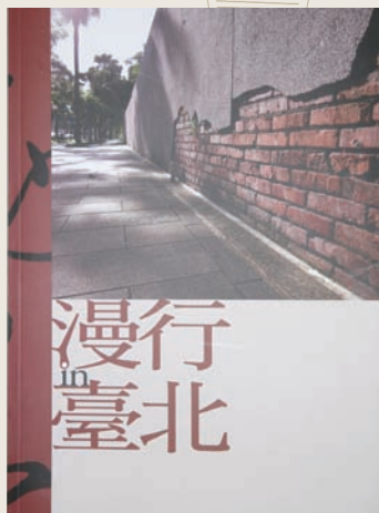
New Discoveries in Old Taipei opens a window to the Taipei of old