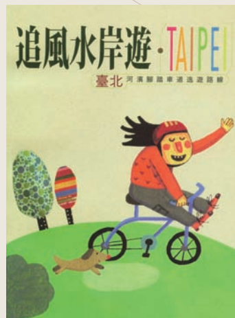
Chasing the Wind: A Guide to Riverside Bicycle Paths in Taipei