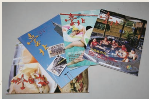
Taipei Pictorial provides readers with a new leisure enjoyment

Regarding the sharp increase in digital publications in 2007, many magazines rushed out electronic editions, especially in the language-learning segment of the market. This development is in line with overall trends in the digital age.