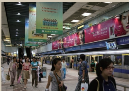
Over 10 million MRT EasyCards have been issued

On October 13, 2007, the Taipei Smart Card Corporation officially announced that the number of EasyCards issued had crossed the 10 million mark. The EasyCard can currently be used for MRT and bus travel, parking fee payments, the Maokong Gondola, admission to the Taipei Zoo, and as a combination library card and student ID for borrowing books from the Taipei Public Library. Furthermore, since the combined population of Taipei City, Taipei County and Keelung City is about 6.7 million, about one-third of the EasyCards in circulation, or approximately 3.3 million cards, are in use by residents from other counties and cities. By 2021 the MRT system in Taipei County and Taipei City will have a total length of 303 kilometers, enabling widespread travel using the EasyCard. Moreover, on December 10, 2007, the EasyCard was officially accepted for payment of highway tolls on the Taipei-Yilan Freeway. In future, the card will also be accepted on a trial basis by the Taiwan Railway Administration for train travel to Zhongli.