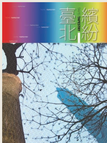
Taipei Tapestry presents the many faces of Taipei

Another trend evident in the publishing world last year was the influence of Japanese and Korean movies, entertainment and popular culture. Film books were highly popular among readers and celebrity autobiographies flooded the book market.