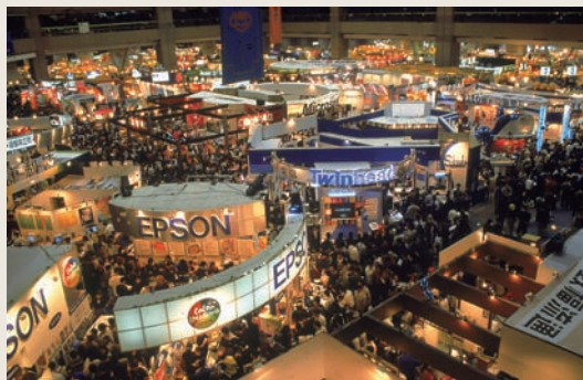
IT Month attracted a strong turnout