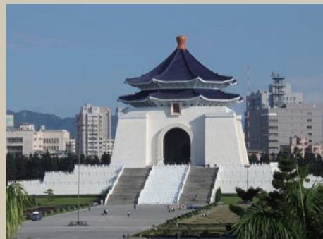
The Ministry of Education changed the name of the Chiang Kai-shek Memorial Hall to National Taiwan Democracy Memorial Hall

The Executive Yuan planned to remove the perimeter wall of the Chiang Kai-shek Memorial Hall and rename the hall the "National Taiwan Democracy Memorial Hall." On March 6, 2007,