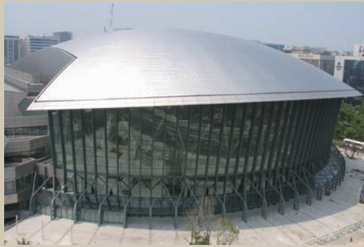
The Taipei City Government took over control of the Taipei Arena

On August 31, 2005, the Taipei City Government contracted the Eastern Dome Management Company (EDMC) to take over the operation and management of the Taipei Arena. EDMC was later suspected of illegal collusive bidding over the operation rights. The company also had violated its contract on several occasions during its management of the arena. As a result, the Taipei City Government terminated its contract with EDMC in accordance with the law and terms of the contract. On August 22, 2007, the city took over the management