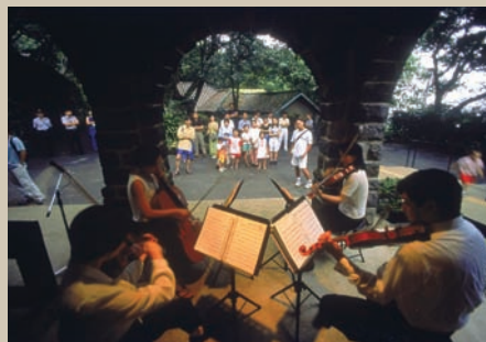
Grass Mountain Chateau was a popular recreation spot for city residents

Situated at No. 89 Hudi Road in Taipei's Beitou District, Grass Mountain Chateau was heavily damaged by a fire in the early morning hours of April 7, 2007. Despite a rapid response by the police and fire departments, the main halls of the building were almost entirely lost to the flames. Damages extended over about 660 square meters of the chateau. Most of the interior wooden structure was burned down, leaving only the stone structures intact. The historic site and its surrounding area are currently closed to the public. The time and cost of repair work is being assessed by a professional architect. An initial decision was made to preserve the undamaged stone structure of the chateau and in future to improve the building's ability to withstand earthquakes and fires.