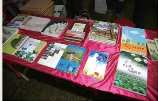
High-quality book series published by the Department of Information and Tourism

Apart from commercial and academic publishers, government agencies are also major publishers of books in Taiwan. The Department of Information and Tourism of the Taipei City Government has for many years published high-quality books. For six consecutive years the department has won the Executive Yuan Award for Government Publication Services, and its serial books have been recognized numerous times over the years as Outstanding Government Publications. Taipei Pictorial and A Taste of Taipei won the 2007 Awards for Outstanding Government Publications; moreover, 2006 Traveling in Taipei , Eight Years of Growth in Taipei: Shedding the Old Skin , Taipei Pixel , and Refreshing in the Woods of Taipei won special honors in the “2007 Outstanding Government Publication Awards” held by the Taipei City Government.