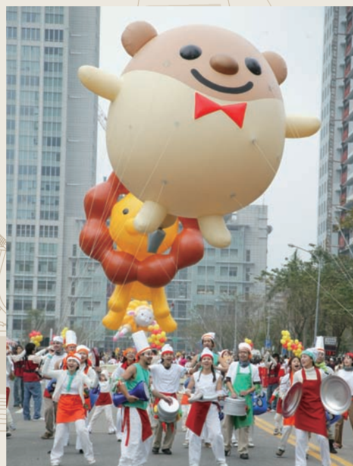
“Taipei New Year’s Eve Party: Countdown to 2008”

The promotion of education and community friendship for new immigrants is another part of the work at the Discovery Center of Taipei. In 2007, the center cooperatively held the “New Immigrant Parent Home Education Activity.” On April 21, it organized a lecture on “Speak & Sing Taiwan Nursery Rhymes” and an event promoting children’s plays called “DIY Let’s Fold Together!” On May 20, the center participated in the 2007 Community Friendship