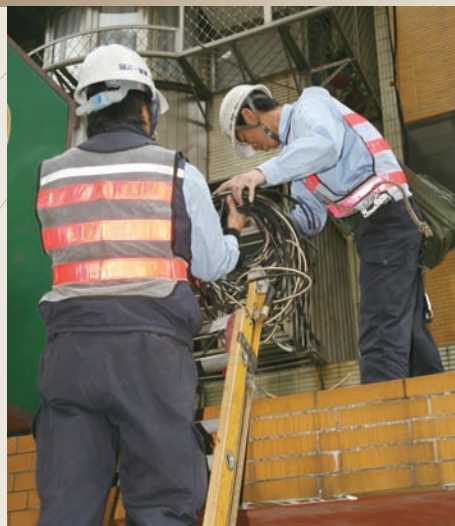
Cable TV operators routinely maintain their cable systems

The upper limit on monthly fees for basic cable service is NT$550 per subscriber. According to programming information for various cable TV systems, operators offered over 90 basic channels in 2007. In addition to terrestrial TV channels, the dominant channels were for movie, news, children’s, foreign language, life, and general programming.