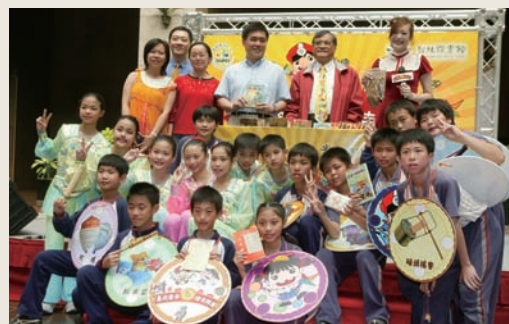
Mayor Hau Lung-bin inaugurates the special exhibition “The Childhood Years in Taipei”