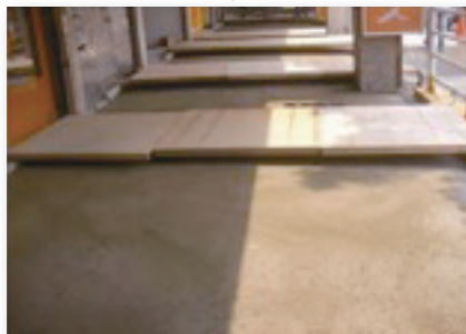
Step board placement (lead time: 0.5 day)