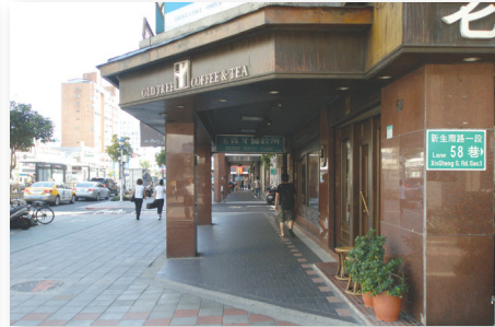
View from the No. 60, Sec. 1, Xinsheng S. Rd.