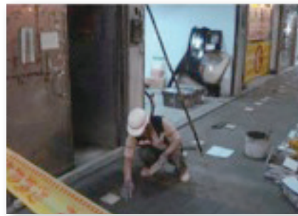
Tile installation (lead time: 1 day)