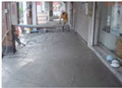
Cement-sand installation (lead time: 1 day)