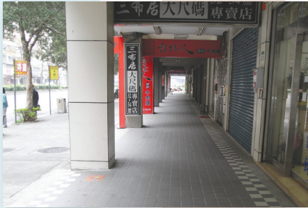
View from the No. 209, Sec. 3, Zhongxiao E. Rd.