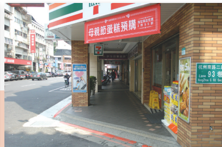
View from the No. 91, Sec. 2, Hangzhou S. Rd.