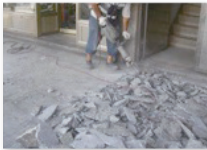
Stone-breaking (lead time: 1 day)