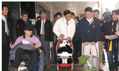
Former Minister of Interior Liao Liaoqi inspecting the progress of the arcade pavement leveling project in 2009