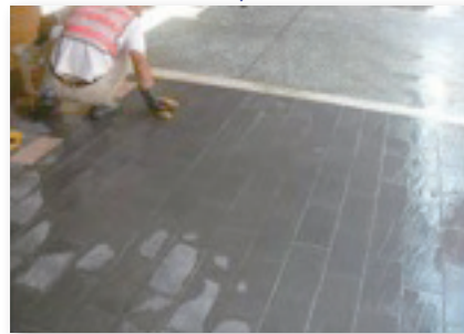
Tile grouting (lead time: 0.5 day)