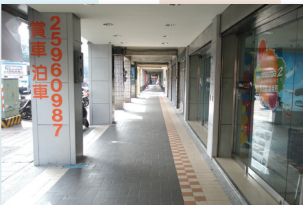
View from the No. 118, Sec. 3, Chengde Rd.