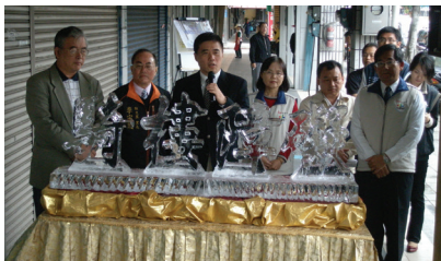
Taipei Mayor Hau Lung-bin inspecting arcade pavement leveling and kicking off the inauguration ceremony

Arcade pavement is actually private property; consequently, the improvement program required the cooperation of property owners. In technical and engineering terms, this program was not difficult; however, communicating with the parties involved became a big challenge and a very critical key to making this program successful. The toughest part of the arcade leveling program was the beginning stage of visiting one household after another to inform residents about the program. With the assistance of the heads and the chief secretary of the district offices, communication successfully proceeded. Since