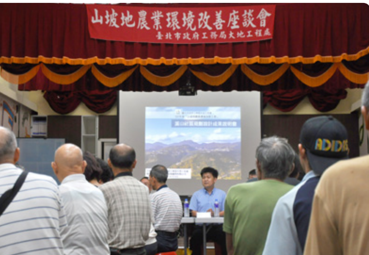
Xishan's Cultural Legacies