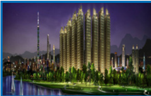
Rendering of Luzhou Station (M6) JD project