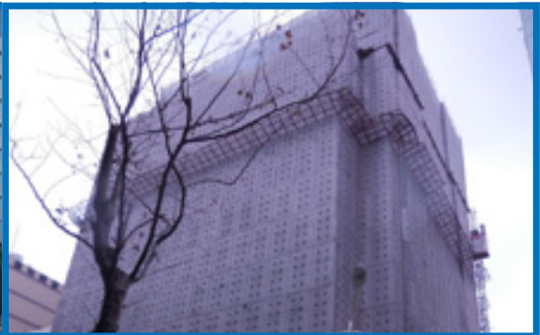
Zhongshan Station (M2) JD project under construction