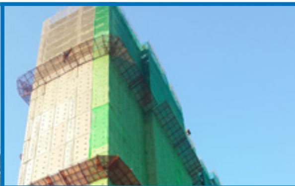
Xinhai Station (T10) JD project under construction