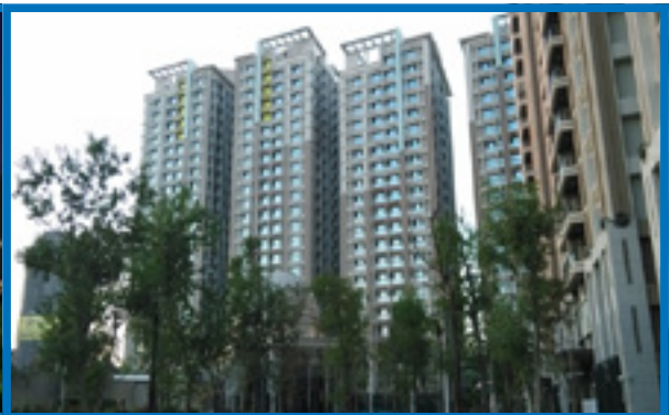
Luzhou Station (M6) JD project under construction