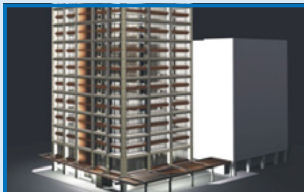
Rendering of Xinyi Anhe Station (M5) JD project