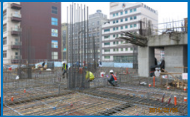
Zhongshan Station (M1) JD project under construction