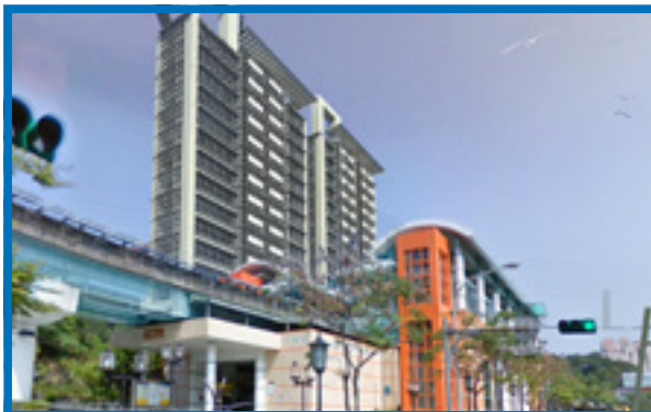
Rendering of Xinhai Station (T10) JD project