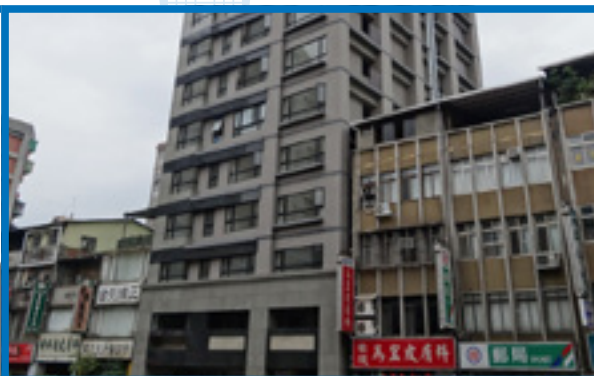
Dapinglin Station (M8) JD project under construction