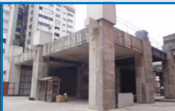
Xinyi Anhe Station (M5) JD project under construction