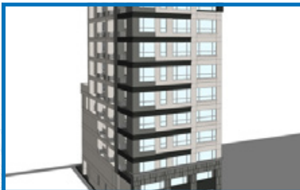
Rendering of Dapinglin Station (M8) JD project