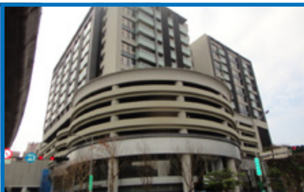
Neihu Station (T11) JD project under construction