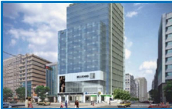
Rendering of Zhongshan Station (M2) JD project