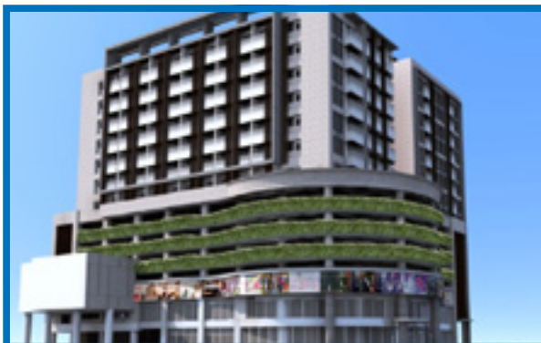
Rendering of Neihu Station (T11) JD project