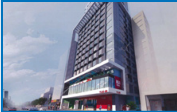
Rendering of Zhongshan Station (M1) JD project