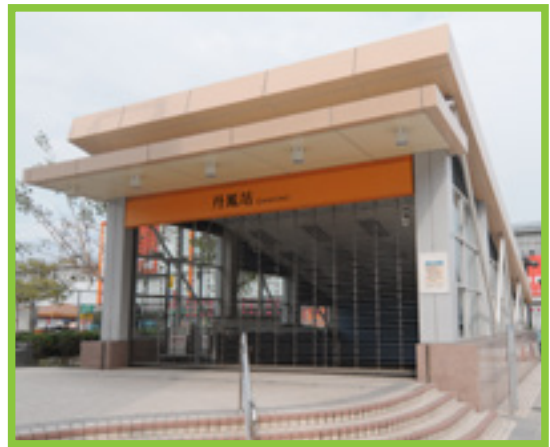
Entrance to Danfeng Station

The Xinzhuang line, which runs through Taipei and New Taipei City, opened in stages: the section between Daqiaotou and Fu Jen University stations was inaugurated in 2012 and the section between Fu Jen University and Huilong stations was inaugurated in 2013. Architecture and decoration of each station is based on the history and culture of each area in order to retain local characteristics and identity.