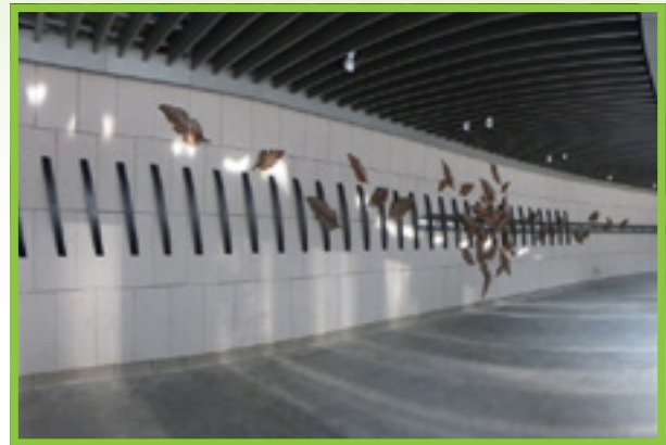
“Autumn Leaf Travelers”

The artwork, exhibited on the wall in front of escalators on the transfer passageway level, is the brainchild of a Taiwanese artist. Acrylic elements were added to painted pottery plates embedded in acrylic embossment to create gradual light and shadow changes. Parts of the acrylic were painted to symbolic effect. When passengers stand in front of the heart-shaped mirror, the artwork reflects them and the environment, showing a metaphor that the environment tolerate folks with love and folks response to the environment with love too.