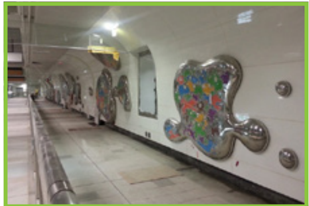
"Tree Frog Hearts in Blossom"