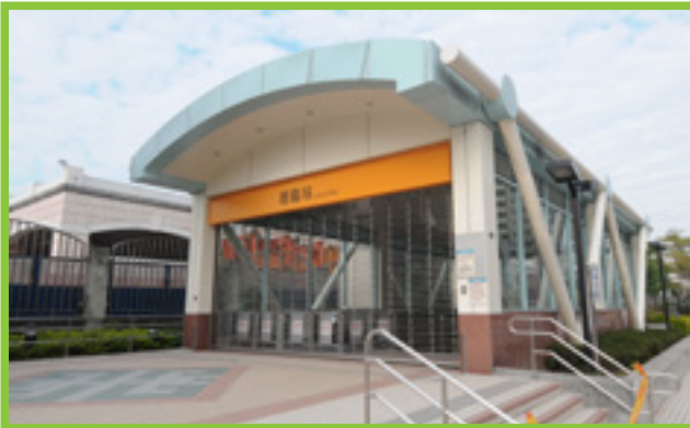
Entrance to Huilong Station

Most station facilities are located outside a wall next to Xinzhuang Depot and aligned with the depot's Zhongzheng Rd. exit. Besides coordinating with the color of Xinzhuang Depot, light pink and gray were adopted as station theme colors and exits/entrances were made to be illuminated and transparent. To reduce facilities placed on road surfaces, cooling towers were built above vent shafts. Part of the station ground-level area was reserved for landscaping, plant and public art exhibition use as well as transfer parking.