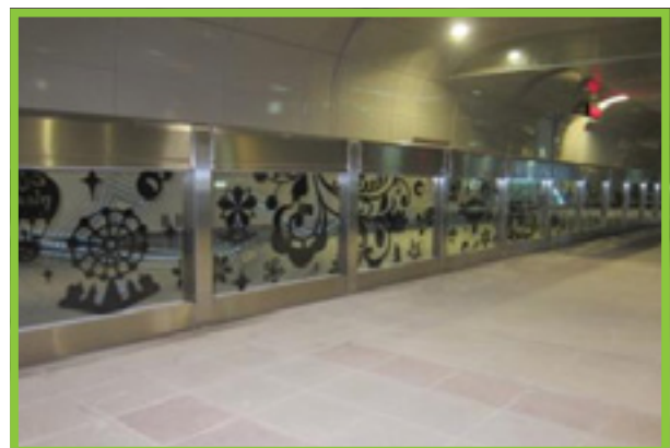
“Water City Taipei”

Modern times are represented by paper cuttings, each with a specific image and meaning, which the artist has linked into a story. Natural plants, street scenes and fantasy planets meet one another in the future to form a narrative of symbiotic prosperity and an endless space for viewers to imagine.