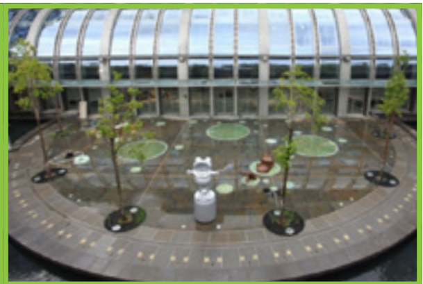
"Spring Light Appears"