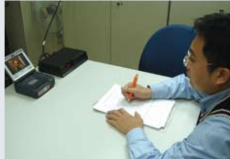
Cable TV side recording by the Department of Information and Tourism.

The revised act removes provisions on local government authority limits and ad spot opening rules. The Taipei City Government, other local governments, and cable television operators all felt that further discussion was needed. After negotiations and meetings between government agencies and operators, additional revisions were made to sections of the act. The re-amended draft was submitted on August 2 to the Executive Yuan for deliberation. Among the changes, Article 44 stipulated that subscriber fees for the digital channels and analog channels offered by cable television system operators would be reviewed, respectively, by the competent authorities at the central and local levels.