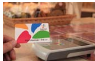
The EasyCard small payment service launch.

After a strong push by the Taipei City Government, the Financial Supervisory Commission formally approved an application by EasyCard Corporation to provide electronic payment services. The decision cleared the way for the use of EasyCards for small payments, providing cardholders with a convenient and safe consumer service.