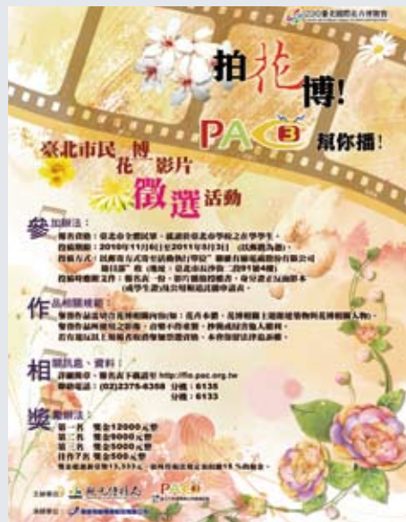
A public Flora Expo filming activity held by the Taipei Public Channel.

Along with strong growth in the cable television sector, the Taipei City Public Channel has achieved an admirable report card. According to statistics compiled by the Taipei Public Access Channel Association, in