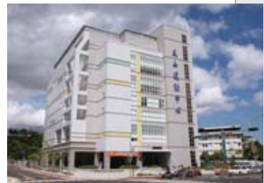
The Wenshan Sports Center opened on August 29.

The Wenshan Sports Center officially opened on August 29, 2010, bringing to culmination a project to establish sport centers in all 12 of Taipei City's administrative districts. The citywide centers are expected to attract over one million visits per month.