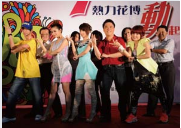
The 100-Person Flora Expo Dance activity.

The Flora Expo 100-day Countdown and Flora Expo Dance activity was held on July 29, 2010, at the Zhongzheng Sports Center. Taipei Mayor Hau Lung-bin, the female band S.H.E, Taipei City councilors, leading officials of the Taipei City