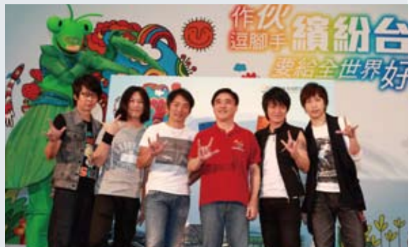
Mayday Flora Expo press conference.