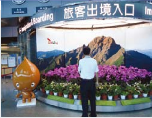
A Flora Expo installation at Taoyuan International Airport.