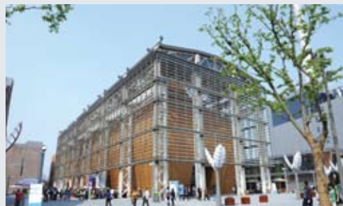
The Taipei Pavilion at the 2010 World Expo in Shanghai.

Taipei is committed to international marketing. The city has earned international repute and media attention for its advanced urban development, wireless network services, recycling programs and other achievements. It was also invited to establish the Taipei Pavilion at the Urban Best Practices Area (UBPA) for the 2010 World Expo in Shanghai, providing a global stage to present the city's