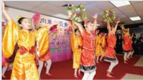
A celebration ceremony for the virgin flight on the Songshan-Haneda route.

On June 14, 2010, Taipei Songshan Airport launched direct flight service to Shanghai Hongqiao International Airport. On October 30, Songshan Airport began offering direct flights to Haneda Airport in Tokyo, re-establishing Taipei as a major hub in East Asia's golden flight circle. Mayor Hau Lung-bin took the virgin flights on both of the new routes to Shanghai and Tokyo for city marketing visits. He also announced Taipei's ambition to develop as a portal city in the East Asia golden flight circle and Asia-Pacific region, with hopes to encourage the return of overseas Taiwan businesspeople and attract international enterprises.