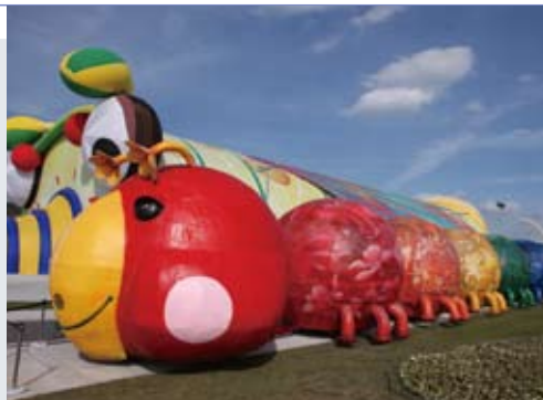
The Happy Travels of a Caterpillar Parade

Outdoor ads promoting the Flora Expo were placed at stations on the MRT Danshui Line, Xindian Line, Bannan (Banqiao-Nangang) Line, and Wenshan-Neihu Line. Expo information was placed on the facades