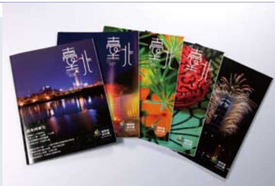
Taipei Pictorial has been effective in its city marketing function.

The Department of Information and Tourism formed cross-media partnerships to promote its publication of Taipei Pictorial and the English-Japanese bilingual bimonthly Discover Taipei through radio, television, well-known websites and newspapers. In addition to existing radio partners, the Police Radio Station and the Taipei Broadcasting Station, Radio Taiwan International became a media partner of the department in March 2009. In the website category, existing partners udn.com and cnYES were joined by Sina.com in November 2009 and by paper.udn.com in 2010 as channels for promoting the content of Discover Taipei . In the newspaper segment, Taipei Pictorial and Discover Taipei reached new readers through high-quality pictorial sections published in the China Times , Liberty Times , United Daily News , Apple Daily , and the MRT-distributed Upaper from June 2009, further strengthening city and tourism promotion, while expanding circulation for these publications.