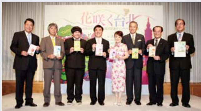
Promotional activity in Japan.