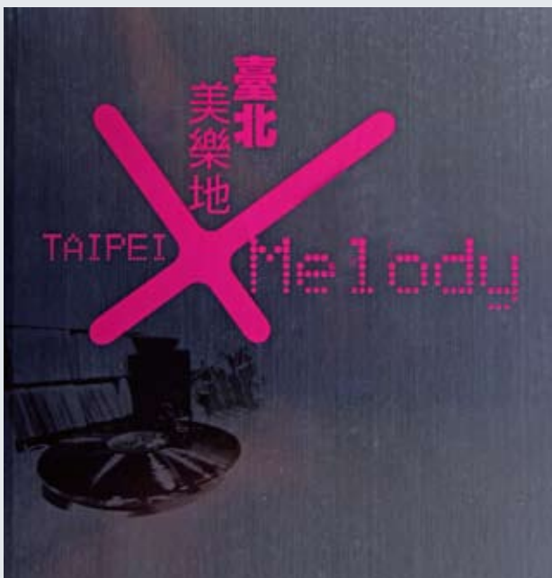
Taipei Melody , published by the Department of Information and Tourism.

According to survey results published by Global Views Magazine in September 2010, Taipei City outranked all other cities in Taiwan on reading competitiveness. Taipei is home to the greatest concentration of publishers in Taiwan and all types of bookstores can be found in the city, including some that have become must-see attractions for international visitors.