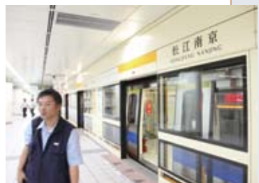
The MRT Luzhou Line began service on November 3.

The MRT Luzhou Line officially began service at 2:00 p.m. on November 3, 2010. The 12.5-kilometer-long line has 11 stations, including six in Taipei City and five in Taipei County. The new line extends the MRT system past the 100-kilometer mark to a total length of 105 kilometers, and will help to expedite western hub line transfers and transportation services.