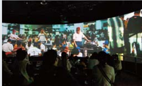
A film at the Taipei Pavilion's 101 3D Theater during the World Expo.

The 101 3D Theater at the World Expo Taipei Pavilion presented the film: "Taipei · Life · Smiles." The film was also simultaneously shown at the Discovery Center of Taipei's Discovery Theater in conjunction with a special exhibition on the Taipei Flora Expo.