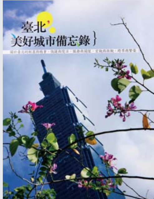
Taipei: Memorandum of a Wonderful City , a handbook on policy achievements.

Furthermore, the Department of Information and Tourism continued to publish Taipei Pictorial , the English and Japanese bimonthly Discover Taipei , Chinese, English and Japanese versions of the Spectacular Taipei tourism brochure series, as well as other regularly issued publications introducing Taipei's visitor sites, tourism activities, and other information. At the end of 2010, the department published a Chinese-English bilingual book called Impressions of Taipei A to Z to promote the beauty of Taipei. In addition to giving away the books to local and foreign VIPs, the book was put on sale as a reference for visitors and residents.