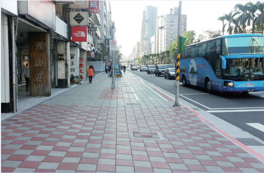
Xinyi Road sidewalk

completion, the service quality of urban roads in Taipei has been improved significantly to provide a safe and comfortable driving network. For its aggressive action and dedication to road maintenance, the Taipei City Government was ranked the top of the urban category in the 2014 Performance Evaluation of Urban Road Maintenance and Management implemented by the Construction and Planning Agency of the Ministry of the Interior.