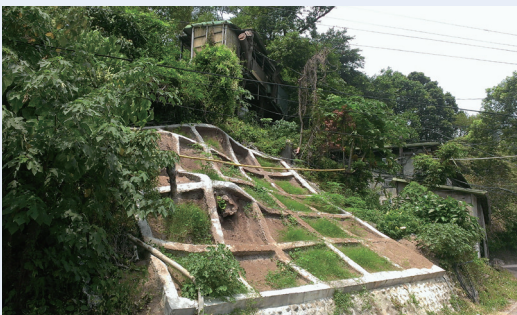
Slope improvement with free posts and beams

To ensure the safety of citizens living in slope areas, the Taipei City Government implements routine maintenance of drainage sludge, dangerous trees and relevant facilities near slopeland buildings. The Taipei City Government also implements emergency maintenance and management of hazards around slopeland buildings in the city during typhoons and torrential rain to prevent disasters. In addition, to ensure the function of completed soil and water conservation facilities, the Taipei City Government continuously maintains soil and water conservation facilities. In 2014, the Taipei City Government examined 551 soil