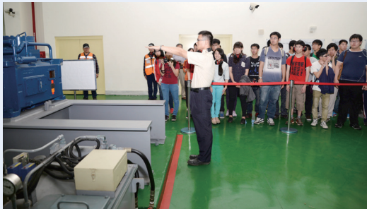
Xinsheng Pumping Station guided tour

In order to make citizens understand the flood control facilities in Taipei City and their management and maintenance achievements, the Taipei City Government has launched educational courses on water resources to transform water conservancy facilities into educational facilities. By opening the control center of the pumping station, Taiwan's first pumping station automatic control system, and the new equipment and facilities in the Xinsheng Expansion Station to the public, along with short