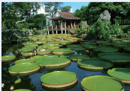
Big is beautiful: the Giant Water Lily Aquatic Plant Show