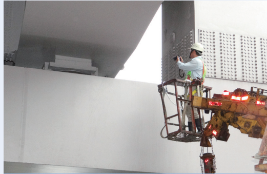
Detailed bridge examination

At present, there are a total of 431 bridges and culverts in Taipei City, including 199