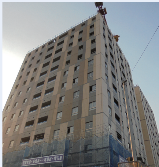
Xinglong Public Housing Phase I construction drawing

The project, expected to be completed in June 2015, occupies an area of 3,594 m 2 , has three stories underground and 18 stories above ground to provide a total of 272 units of housing, with proportions of 67% public housing and 33% affordable housing. To ensure the safety of public housing, the project has obtained seismic resistance design certification and is green building certification is pending.