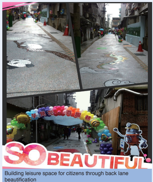
Building leisure space for citizens through back lane beautification

The Taipei City Government incorporated the back alley beautification project into sewage connection construction. For households in