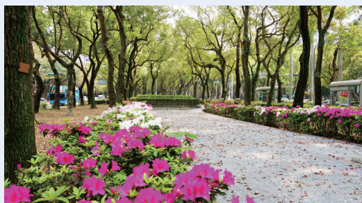
Embellishment of the traffic island in Renai Road with azaleas

Taipei City has a total of 90,129 street trees. In 2014 a budget of NT$85.5 million was planned for road greening and park beautification enhancement. The total area of greening and beautification was 147,860 m 2 , a total of 710 street trees, 177,994 shrubs, 5,129 m 2 of lawn, and 10,593 pots of ground cover were added (filled).