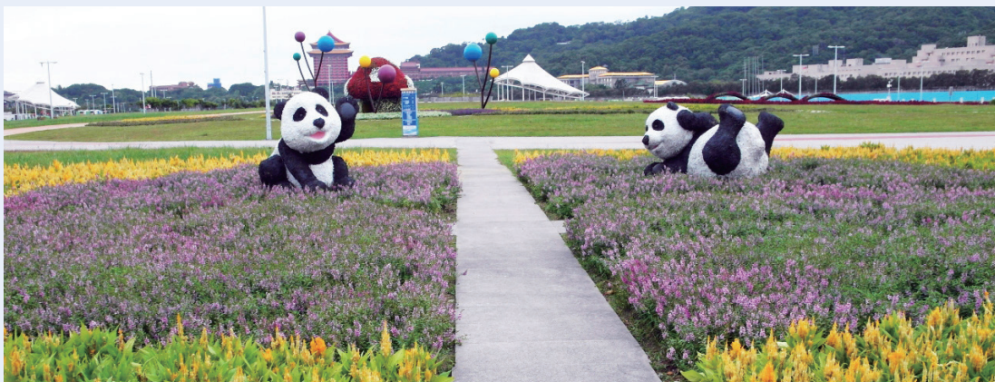
The Sea of Flowers at Dajia Riverside Park

The Hydraulic Engineering Office of the Public Works Department of the Taipei City Government has built six theme riverside parks in Taipei City. The Shezidao Riverside Park and Shezidao Wetlands featuring wetland environment building and ecological tour were