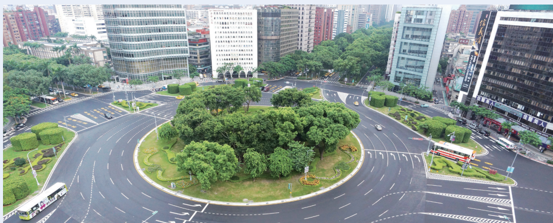
Renai Road Circus Road Renewal Project

In Taipei City, the total road surface area is about 22.52 million m 2 . After deducting the area of traffic islands, sidewalks, ditches, and MRT projects, the actual asphalt concrete area is about 15 million m 2 . This six-year project, from 2009-2014, aimed to upgrade the surface of main roads in Taipei City. During the project period, 280 roads under project control were upgraded, with a total area of 6.72 million m 2 . In terms of ordinary two-lane roads (16m wide), a total of about 420 km was resurfaced, equivalent to the distance from Keelung to Pingtung on National Highway No. 3. In addition, the number of manholes on the upgraded road surface has been reduced to 47,994 manholes. After project