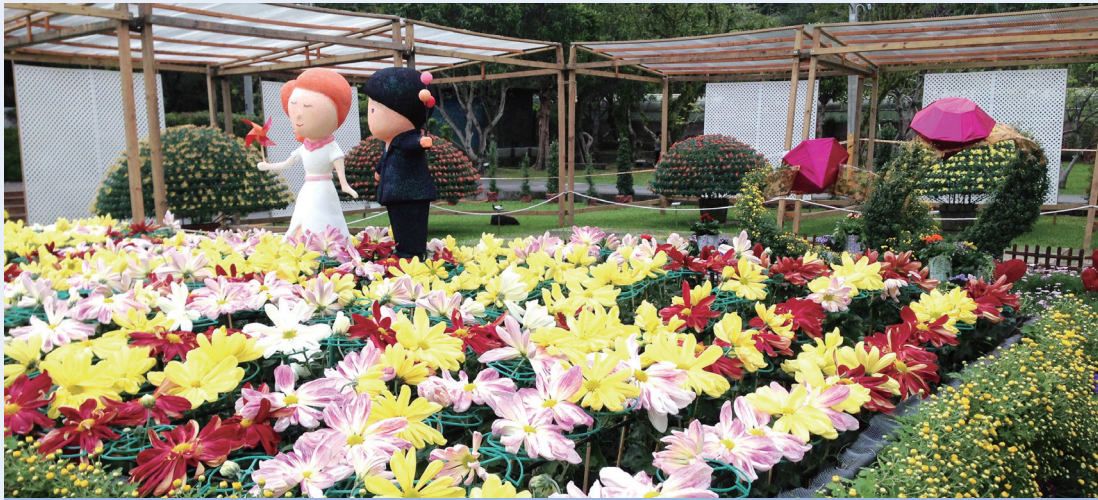
A colorful and varied chrysanthemum show