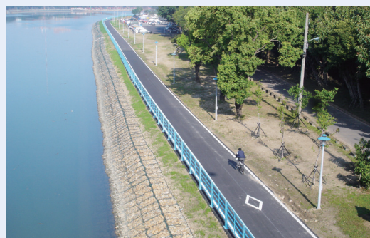
Keelung River Low-water Revetment Renovation Project

Referring to the “Taipei Flood Control Plan” approved by the Executive Yuan, building embankments supported by river training and river management are the flood control policy of Taipei City. Projects completed in 2014 included the Embankment Construction and River Training Project on the right bank of Jingmei River (from Wanfang Interchange to Wanfang Road), Taipei City Embankment Beautification Project (contracts 2, 3, 4 of phase I, and contract 1 of phase II), Keelung River Low-water Revetment Renovation Project Phase I (Bailing Bridge to Zhongshan Bridge), Neigou River Landscape Improvement Project (contract 2), Taipei City CCTV River Flood Surveillance Equipment Project Phase I, Pumping Station Environment Improvement Project Phase I, Pumping Station Environment Improvement Project Phase II (contract 1), the renewal project of Zishan, Fude and Jinzhou pumping stations, Revetment and Embankment Facility Improvement Project (Donghu, Lohas, and Xinsheng emergency flood protection roads cross-embankment ways), and Embankment Environment Improvement Project: Nanhu Bridge to Chenggong Bridge.