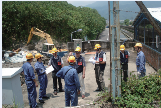
Audit of gas leak emergency repair

In natural gas of Taipei City is supplied by four companies: The Great Taipei Gas Corporation, The Yang Ming Shan Gas Co., Ltd., The Shin-