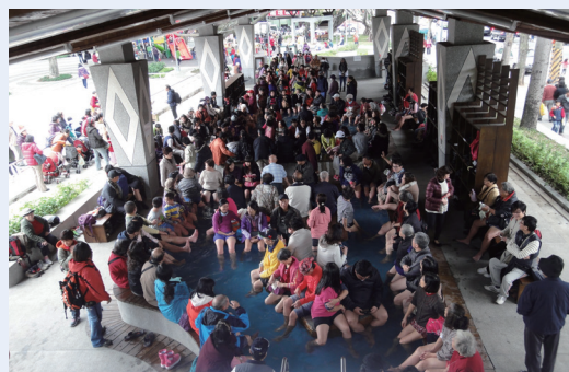
Fuxing Park Hot Spring Foot Spa Pool

The hot spring foot spa pool at Quanyuan Park in Beitou District attracts over 750 visitors each day and with a customer satisfaction rate of over 97%, it has become one of Beitou's most important public leisure facilities. To respond to the expectations of citizens and promote the diversification of hot spring uses, the Department of Economic Development of the Taipei City Government established new hot spring foot spa pools in Liouhuang Valley and Fuxing Park. Both hot spring foot spa pools were opened in 2014 and attracted about 2,000 people each day.