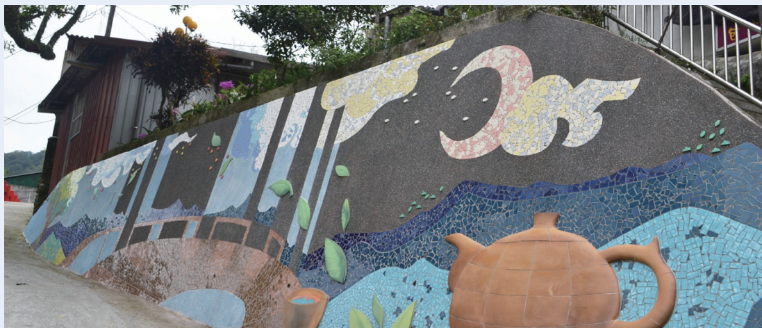
Teapot image beautification on Zinan industrial road

km in Taipei City. After effectively combining culture with the landscape, the Geotechnical Engineering Office of the Public Works Department of the Taipei City Government completed six circular trails, five characteristics trails, and eight trail image entrances in 2014 to build a complete and characterful hiking trail network system. In addition, besides maintaining basic transportation function and safety, the Geotechnical Engineering Office operates 65 industrial roads with a total length of about 131km in the city with district characteristics to provide citizens with another way to enjoy forest leisure in Taipei.