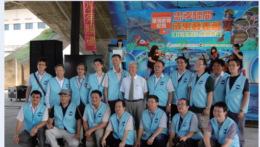
Presentation of an award in recognition of the achievements of Zhongxiao Gravel Contact Oxidation Facility in Taipei City

There are a total of 35 sewage interception stations in the Tamsui River system, including