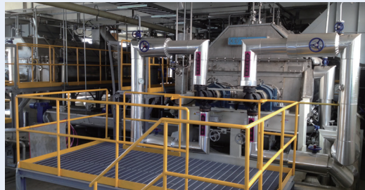
Main unit of sludge drying equipment

The Dihua Sewage Treatment Plant passed environmental education certification on March 25, 2014, to become Taiwan's first urban domestic sewage treatment plant for environmental education. By integrating with sewerage construction, the current natural