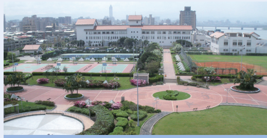
Environmental education venue at Dihua Street Sewage Treatment Plant

environment of the Tamsui River and the cultural and historical characteristics of Dalongdong Culture Park and through environmental education, the education arrangement of the sewage treatment plant enables citizens to understand the process and technology of sewage treatment, so as to achieve sustainable use of water resources.