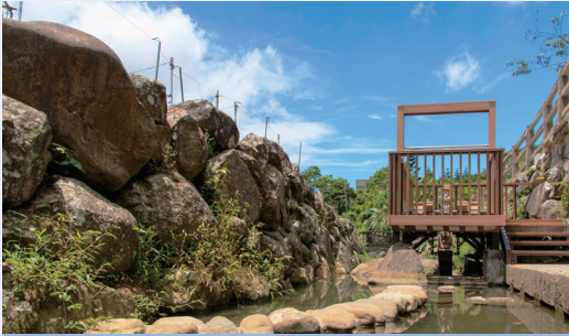
Chouzitou River Nature Park

examining all wide streams and mountain canals in the city, the Office integrated the rich ecology of the Chouzitou Stream with local history, art, and culture to turn it into a nature park integrating ecology, conservation, education, and leisure.