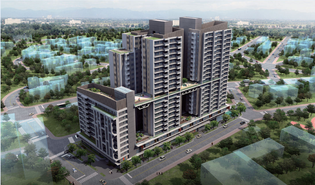
Xinglong Public Housing Phase II simulation drawing

of public service spaces, including a “social welfare service work station”, “BOT nursery center”, “BOT daycare home for seniors”, “community operation facilities for the people with disabilities”, and “welfare organization for people with disabilities” to ensure effective care for underprivileged groups and the promotion of social justice and well-being.