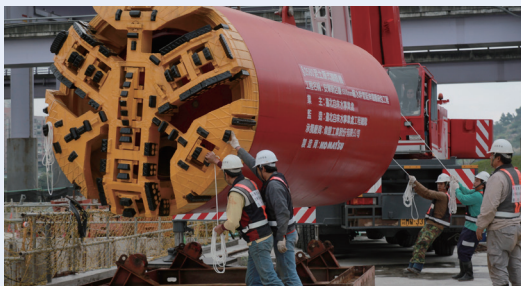
Lifting and installation of TMB for the Anhua – Xindian Extension Line

in October 2012 and the latter in October 2014. After the completion of the entire Anhua – Xindian Distribution Pipe, the Anhua Booster Station on the Xindian Distribution Pipe will replace the Zhonghe Booster Station on the same pipe to supply drinking water for citizens in New Taipei City's Xindian District and serve the Zhonghe Booster Station as a backup booster, so as to complete the dual-system supply for Zhonghe and Xindian districts to support the Banxin Phase II Project.