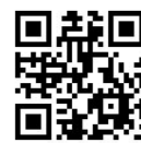
Taipei City Employment Service Office