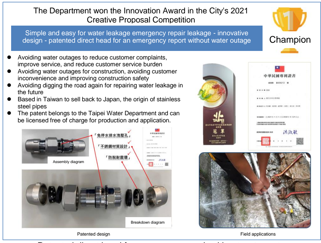
Patented direct head for emergency repair without water outage

In order to improve the pipeline materials used in tap water supply, our team developed the patented direct head for emergency repair, which is "free of water outage", "with anti-dislodging and quake resistance", and "suitable for various materials of pipes", so as to avoid water outage during emergency repair of water supply pipes, reduce the number of water outages during emergency repair, avoid water pollution, improve construction safety, and reduce the number of complaints from customers about the lack of water. Its materials are quake-resistant and cost-effective, and can also avoid digging the road again to repair water leakage in the future. It is expected to improve the quality of the City's water supply service. In January 2021, the project obtained the "Patent Certificate" from the Intellectual Property Office, Ministry of Economic Affairs.