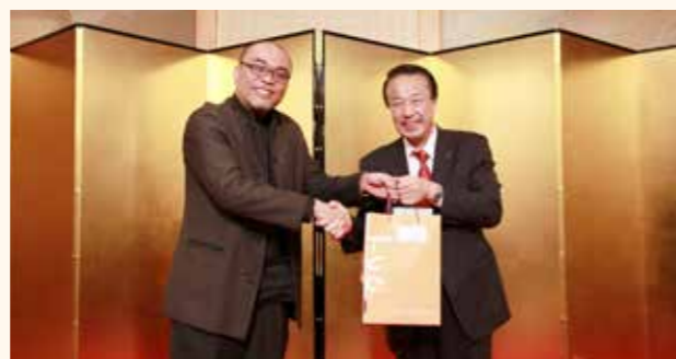
In 2015, the mayor of Kaga personally greeted musicians when TCO toured the city.