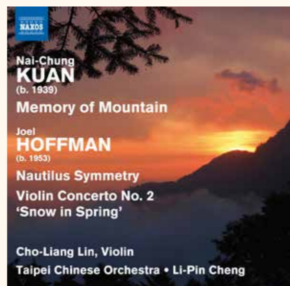
Memory of Mountain was the first album recorded by Taipei Chinese Orchestra (TCO) and leading European record label, Naxos Records. It was released in 2020 around the world.

CHENG Li-Pin believed that cultural and art exchange programs proved to be most productive and influential in helping Taiwan reach out and open the door to the world. The distinct characteristics of Chinese orchestra left deep impression on people, giving TCO a great advantage on world stage. Take the 4 live concerts online due to the outbreak of the pandemic in 2020 for example, they attracted thousands and thousands of audiences and obtained close to 200 overseas media coverage. This not only increased the exposure of Chinese music on international stage, but also showed the world Taiwan's success in keeping the disease at bay.