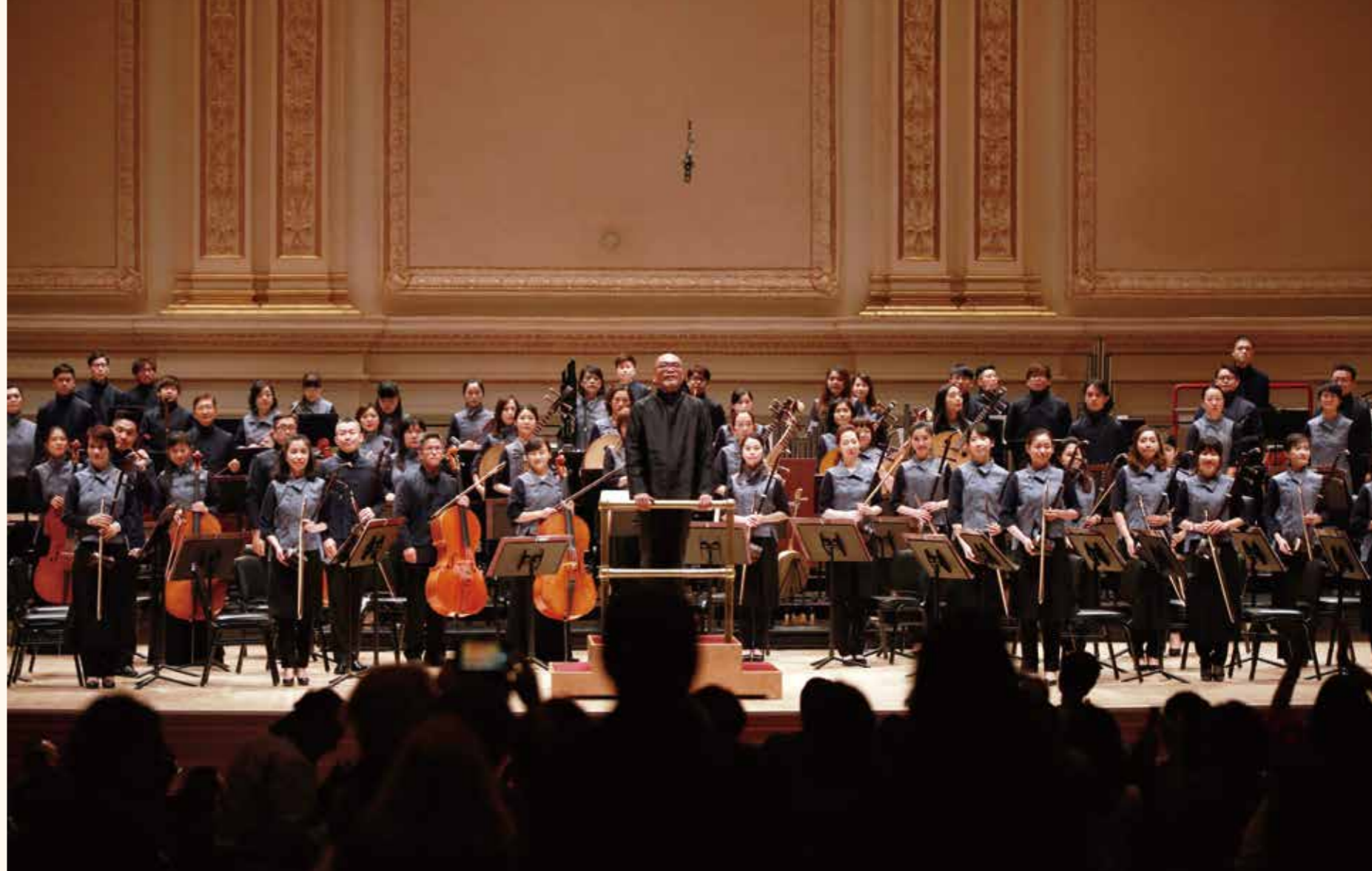
TCO is the 1st Taiwanese professional music assemble to perform at Carnegie Hall in the US in 2018