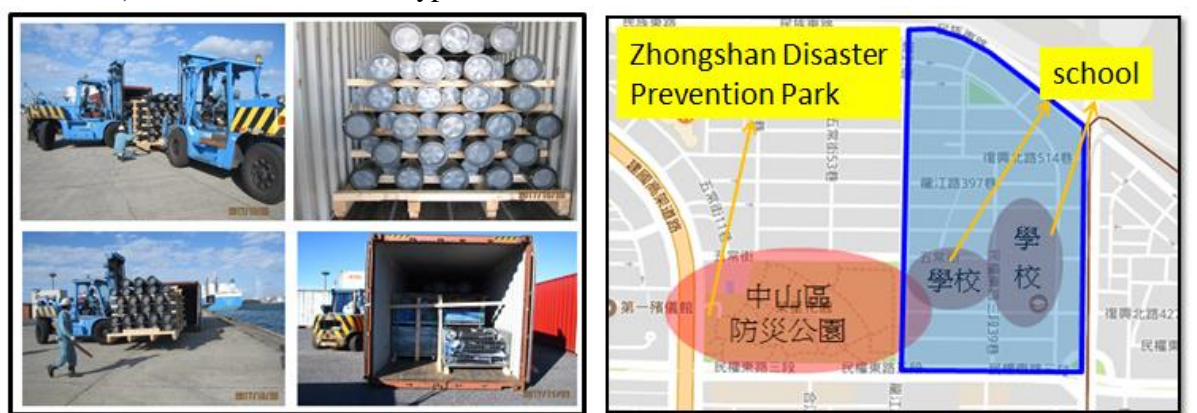
Delivery of seismic pipes

The trial project was completed in November 2018, including 3,630 meters of pipes with a diameter of 200 mm implemented, and 480 meters of pipes with a diameter of 300 mm implemented. A total of 4,110 meters of the NS-type DIP are in use.