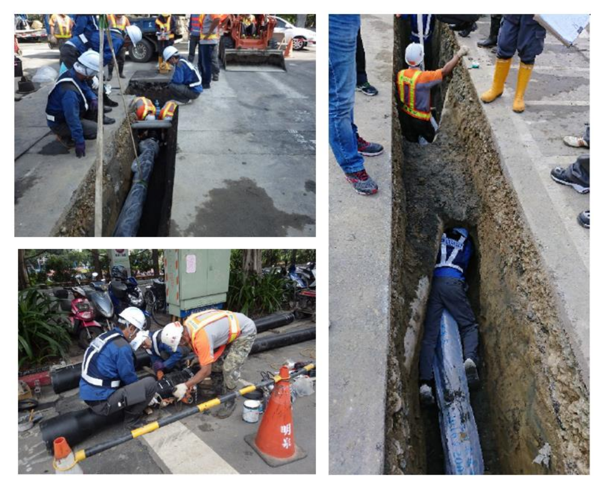
Figure 5 Japanese technicians on-site guidance