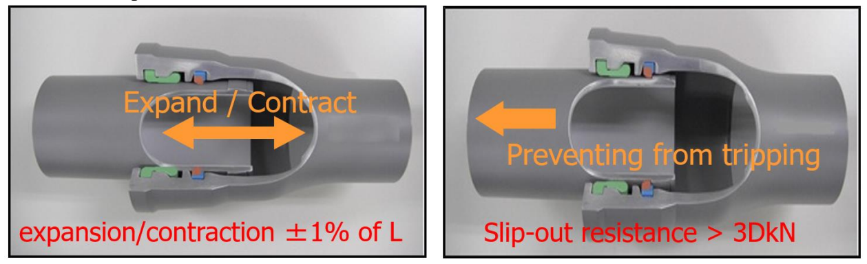
Figure 2 NS trip-proof and retraction

With the above reasons combined, nearly two years after the great Mei-Nong Earthquake, the TWD introduced the NS-type DIP, validated during the great earthquake, to strengthen the pipeline network of Taipei.