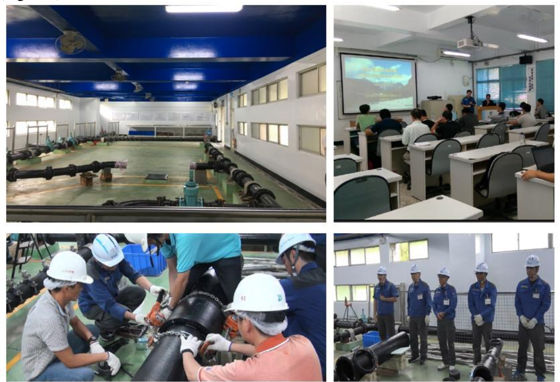
Figure 3 NS-type DIP training site at Zhitan water treatment plant

In hope of initiating NS-type DIP well in Taiwan, TWD have set up a training site at the Zhitan water treatment plant providing not only for TWD staff with hands-on training on piping work profession, but also for many other prospective technicians with certification service. The training site currently accommodates hands-on field operation of pipes with a diameter of 150 mm and 300 mm. (Figure 3).