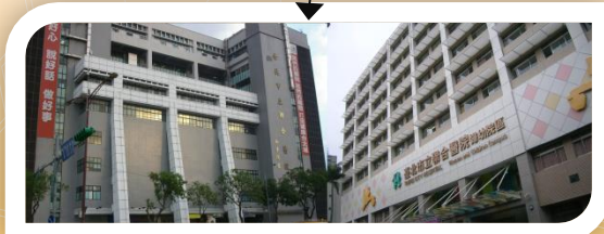
Heping Fuyou Branch