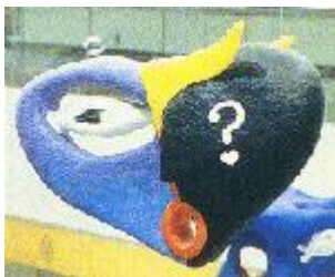
Meeting and Separation