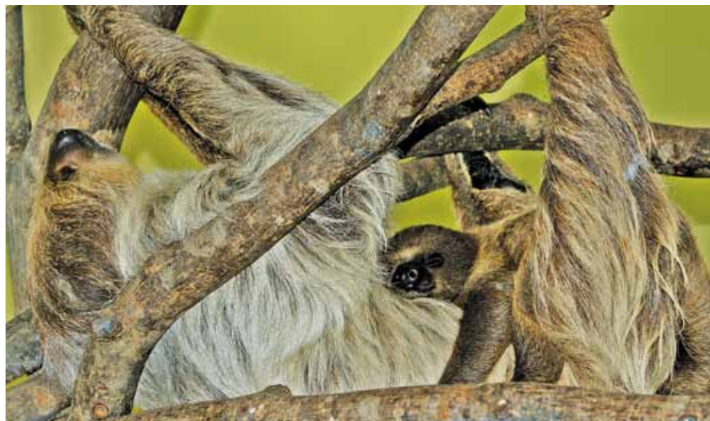
二趾樹獼「小財仔」 ●2月17日出生，大年初四接財神的日子 ●父「大懶」、母「公主」