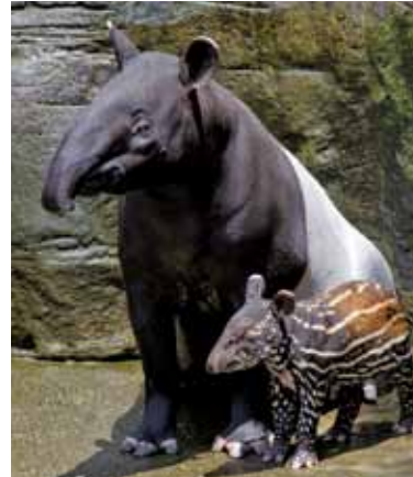
小馬來貘「貘芳」 ●5月3日出生，至12月31日止體重180kg ●父「貘卡」、母「馬雅」