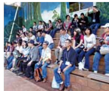
香港海洋公園動物訓練研討會— 參觀雀鳥劇場