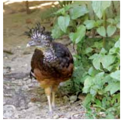
大寶冠鳥「寶貝」，園內首次繁殖。 ●6月3日出生 ●父「寶石」、母「寶珠」