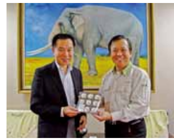
日本釧路動物園園長來訪