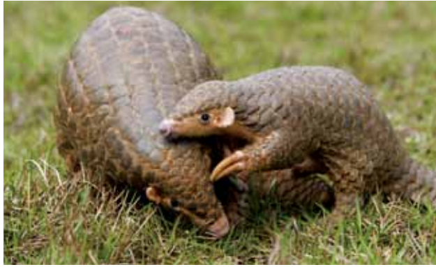
穿山甲 ●12月9日出生。 ●近30年本園成功繁殖的第6隻