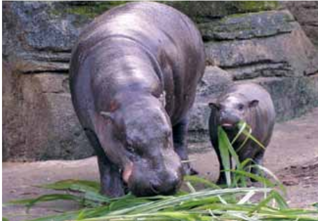
侏儒河馬「小侏」，本園第一隻人工哺育成功的侏儒河馬。 ●9月15日出生，至12月12日止體重23.8kg ●父「夏傑」、母「嬌秋」